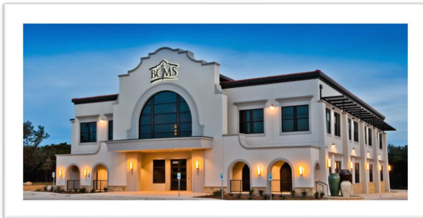
The New Bexar County Medical Society Headquarters 4334 N Loop 1604 W San Antonio TX 78249

The Bexar County Medical Society (BCMS) was established in 1853 as the first county medical society in Texas and was a pioneer in organized medicine. The Bexar County Medical Society covers not only Bexar County, but includes surrounding, contiguous counties that enjoys an average annual membership of approximately 5000 physician members representing all recognized medical specialties. This makes BCMS the eighth largest county medical society in the United States.