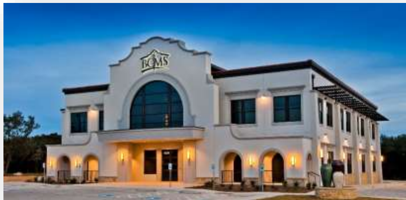
The Bexar County Medical Society Headquarters 4334 N Loop 1604 W San Antonio TX 78249

The Bexar County Medical Society (BCMS) was established in 1853 as the first county medical society in Texas and was a pioneer in organized medicine. The Bexar County Medical Society covers Bexar County, in addition to 7 surrounding, contiguous counties. BCMS is one of the fastest growing medical societies in Texas. With a current membership of approximately 5700+ physician members representing all recognized medical specialties. This makes BCMS one of the largest county medical societies in the United States.